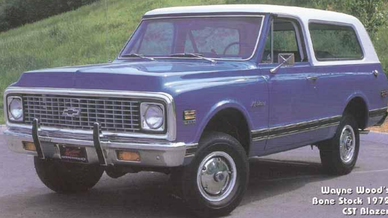
Wayne Wood's Bone Stock 1972 CST Blazer

TRUCK TECH: Turbo Trannies for 6's (page 10)26)