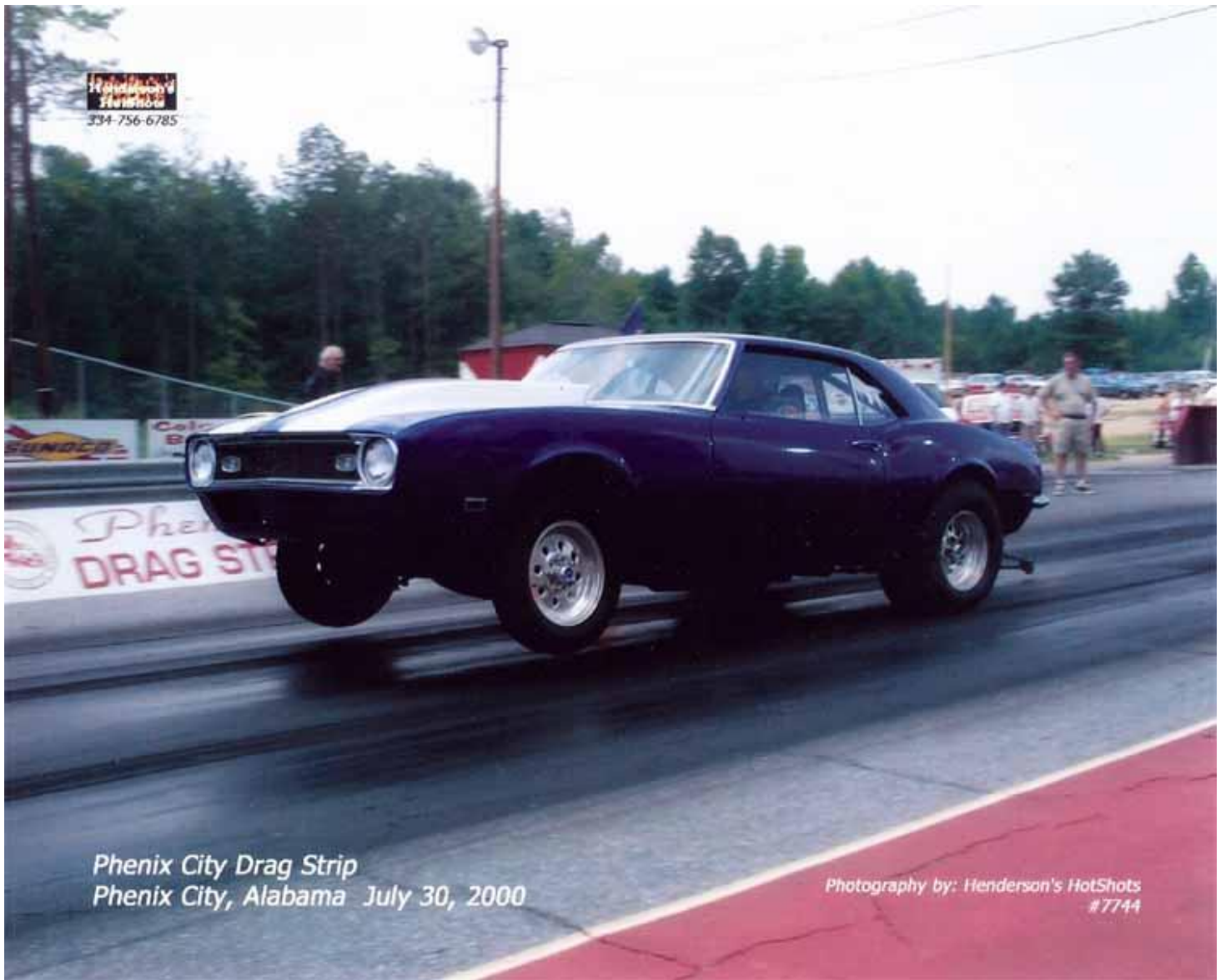
Phenix City Drag Strip Phenix City, Alabama July 30, 2000